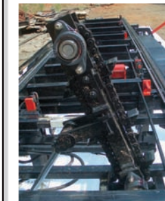
INDUSTRIAL CHAIN TURNER