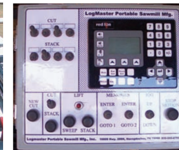
UNLIMITED COMPUTER SET WORKS