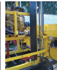
34 HP WATER COOLED 3 CYLINDER CAT DIESEL ENGINE